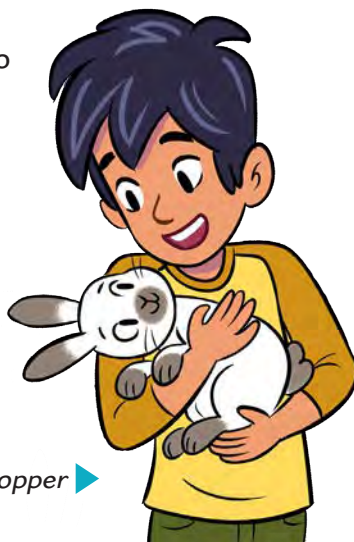
Mikey and Hopper ▶

If you want the ears to stand up, add an extra rectangular tab to the back of each ear!