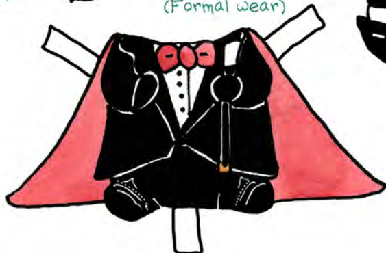
Magician's suit (Formal wear)