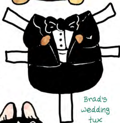
Brad's wedding tux